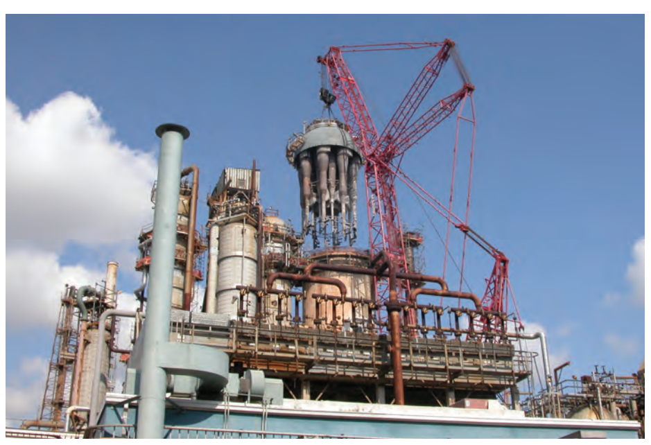
Field-erected regenerator installation lift.